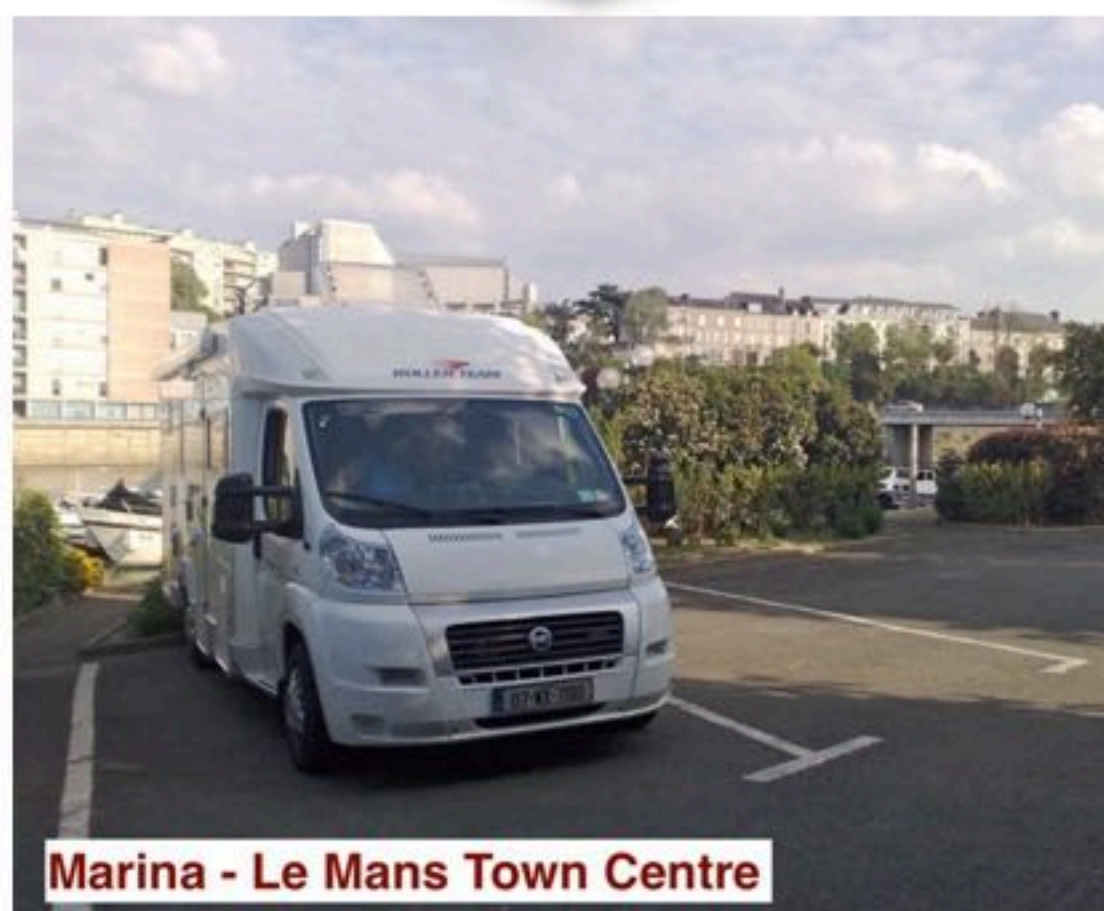
Marina - Le Mans Town Centre

Parking with ease of access to centre maximises visitor experience and economic outcome for host area