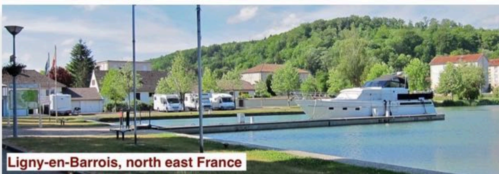
Ligny-en-Barrois, north east France

The average motorhome tourist's mature demographic supports extended leisure time. They are culturally curious, like to linger and discover and the key to maximizing their dwell time and spend in an area is to provide a necklace of stops relatively closely spaced - e.g. the 'Romantic Road' in Germany - http://www.romantischestrassen.de/index.php?id=159&L=0 - which has 19 stops over its 350 kms. Similar destination routes could be promoted in Ireland in areas possessed of multiple attractions, e.g. within Ireland's Ancient East, The Wild Atlantic Way and Lakelands & Inland Waterways.